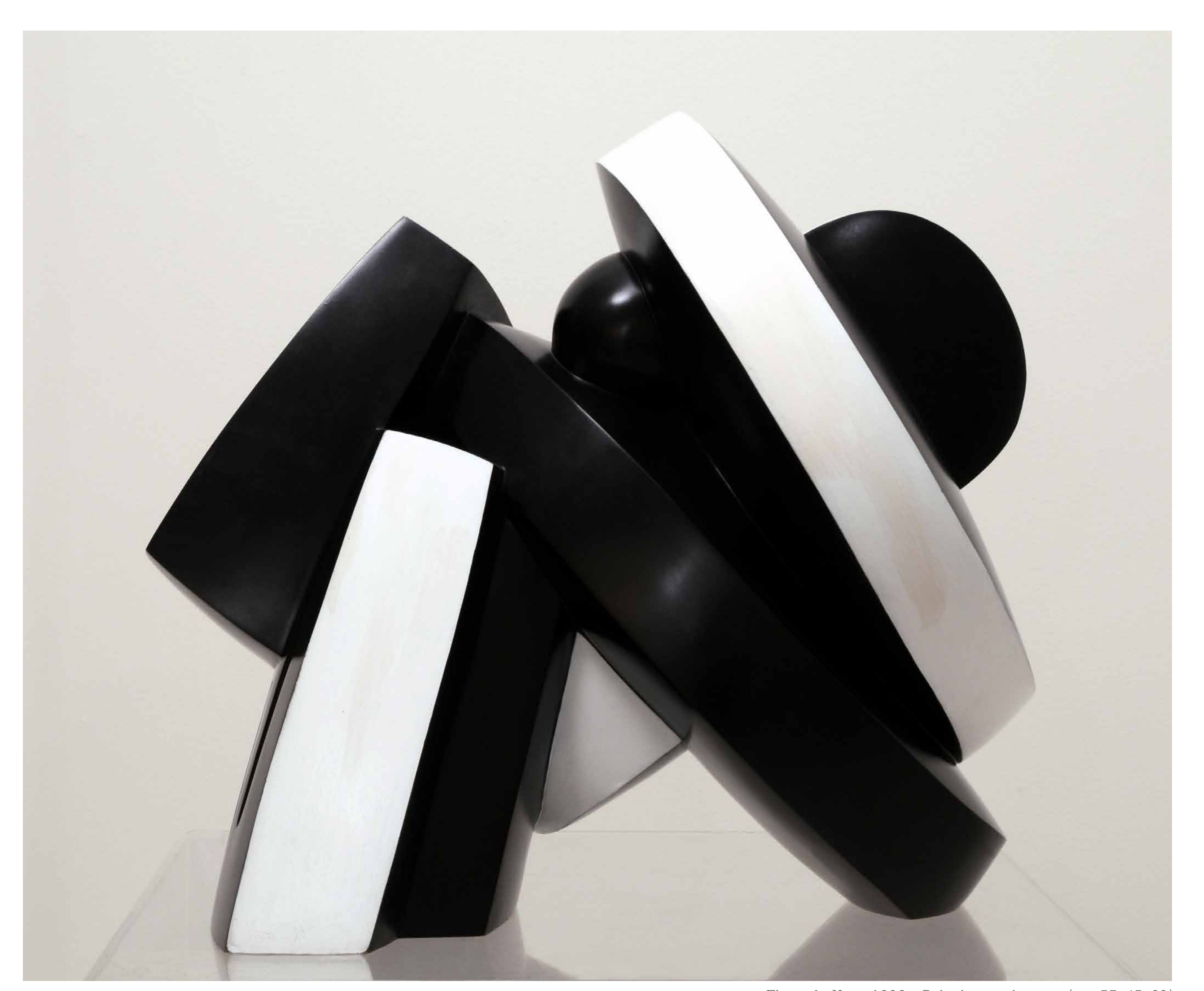
Fleur de Vin - 1998 - Polychrome bronze (cm 57x45x39)