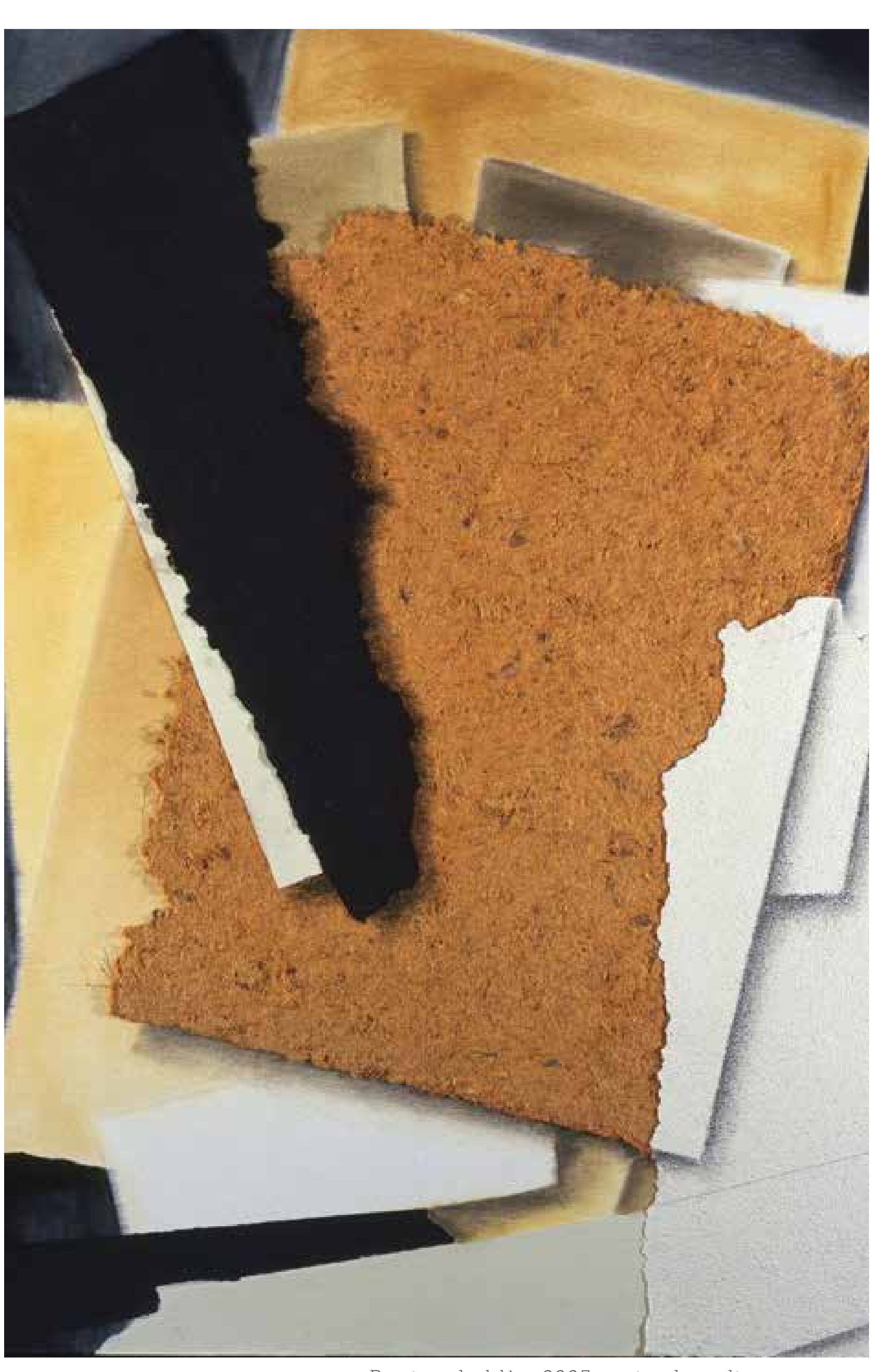
Racine de blè - 2005 - mixed media on canvas

How does Vari create her jewels? "Well, I don't actually plan ahead or ponder: 'now I am going to create a jewel'. It is while I am rough-hewing a sculpture with plasticine models that I may happen to envisage a ring, a necklace or a brooch and start creating it.