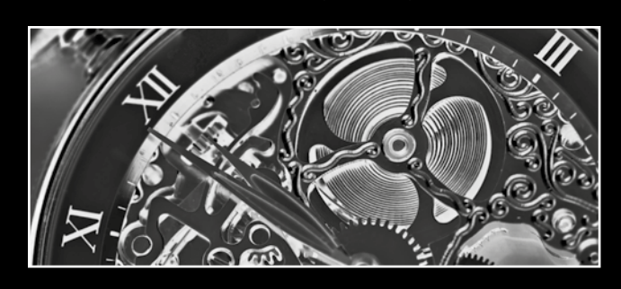
FASHION & JEWELLERY